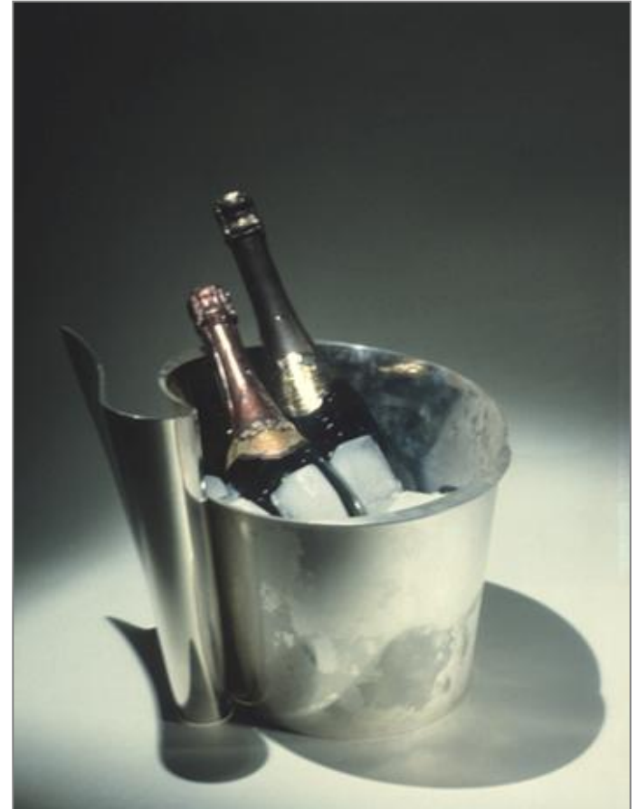
Andreas Fabian, 1991, Champagne bucket