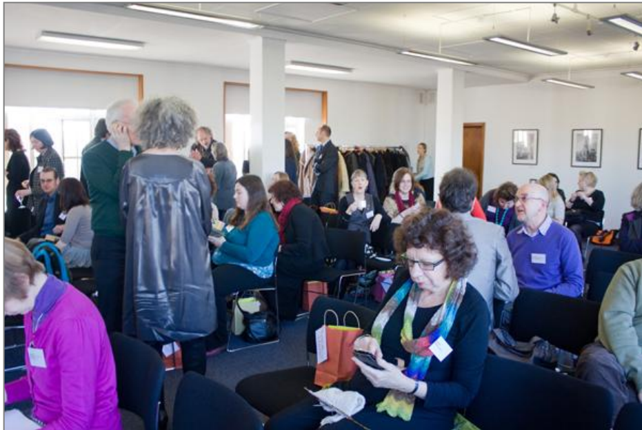
Wren Room: presentations and lunch