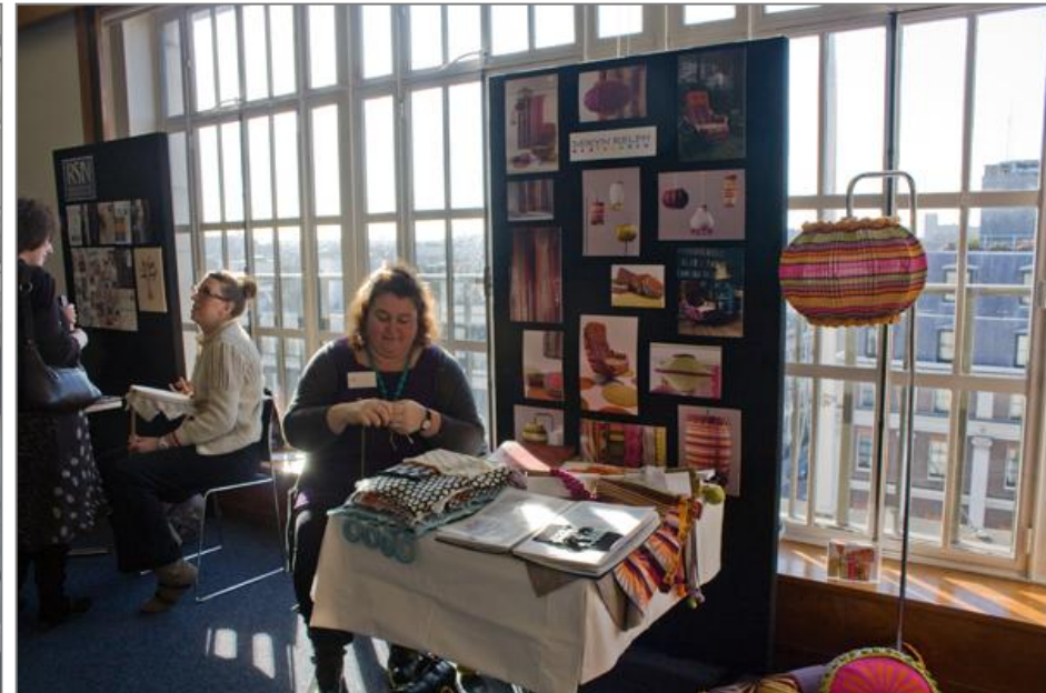
Hawksmoor Room: lunchtime demos