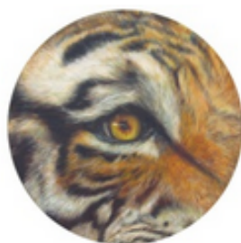
Tyger Tyger (Darwin's Canopy, 2008)